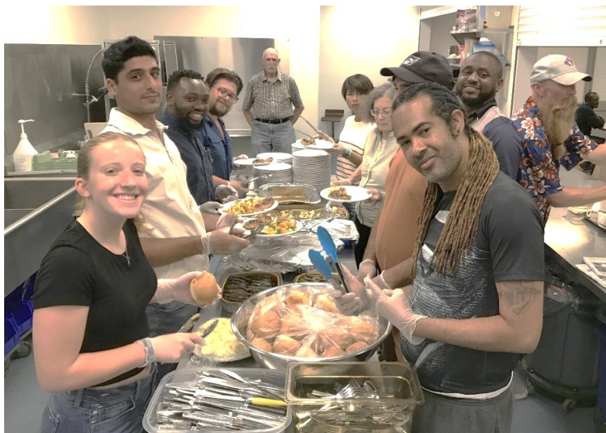
Saturday Night Suppers at Royal City Mission