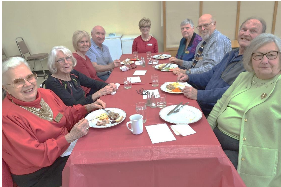
Chi Rho Meeting – December, 2024